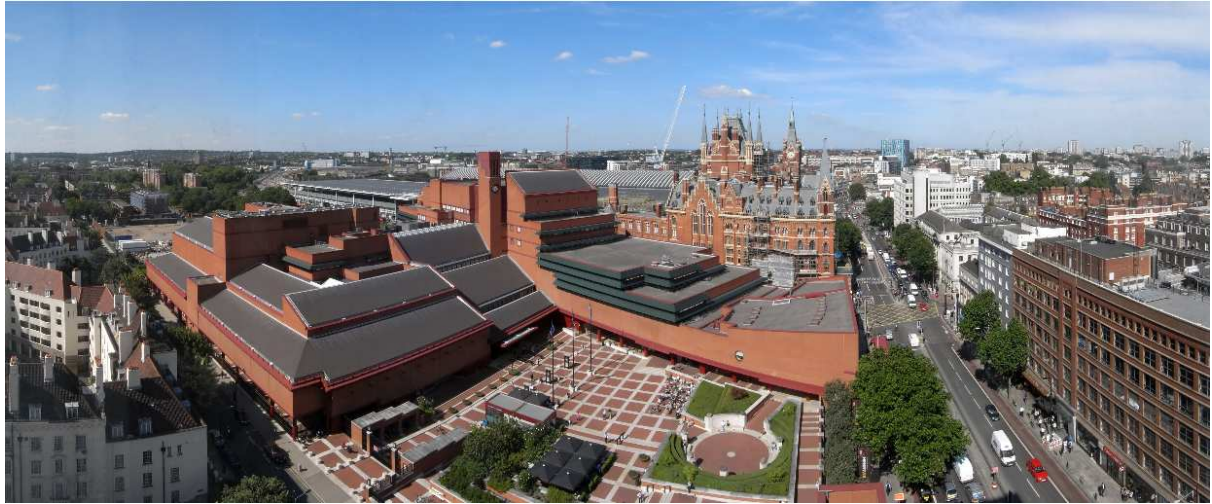
British Library (modern building in foreground) and St Pancras station (spires further back) with Euston Road on the right, London